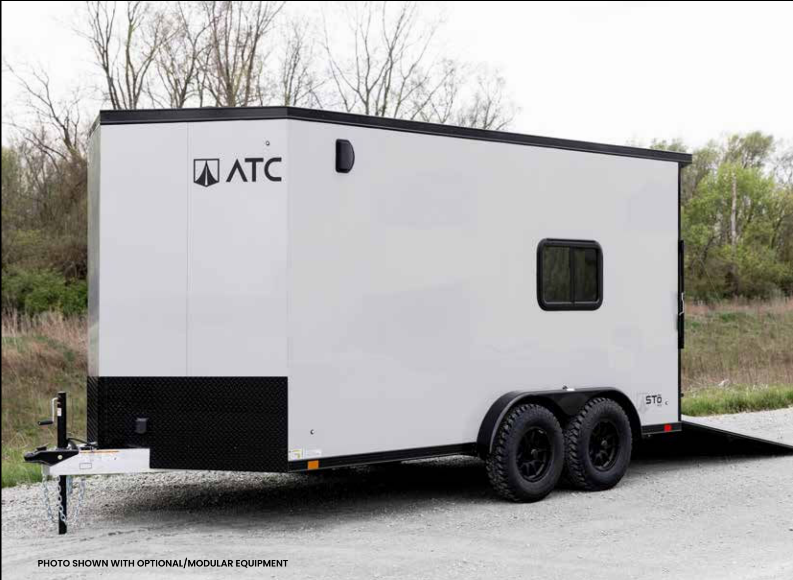
PHOTO SHOWN WITH OPTIONAL/MODULAR EQUIPMENT