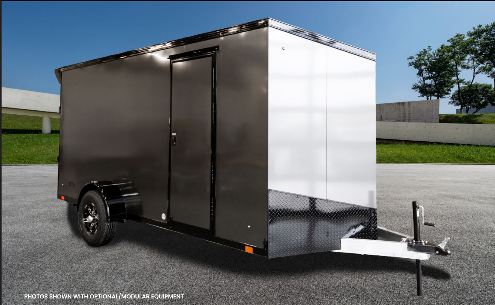
PHOTOS SHOWN WITH OPTIONAL/MODULAR EQUIPMENT