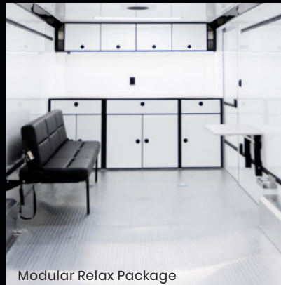
Modular Relax Package