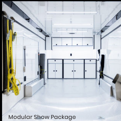
Modular Show Package