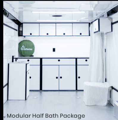
Modular Half Bath Package