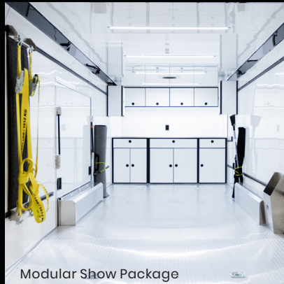
Modular Show Package