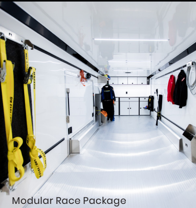
Modular Race Package