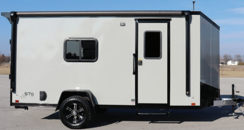
14' Model Pictured