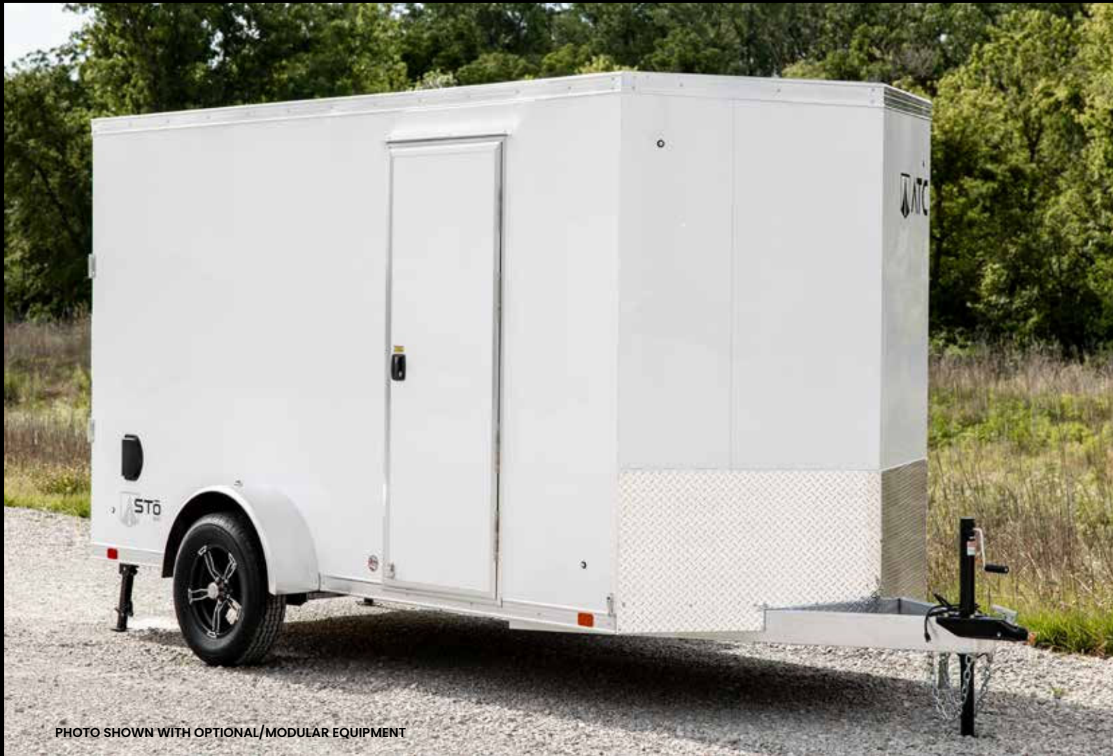
PHOTO SHOWN WITH OPTIONAL/MODULAR EQUIPMENT