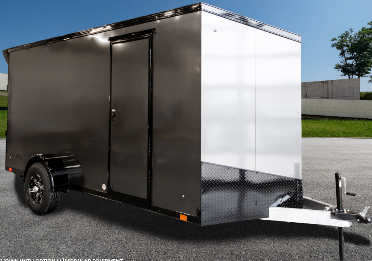
PHOTOS SHOWN WITH OPTIONAL/MODULAR EQUIPMENT