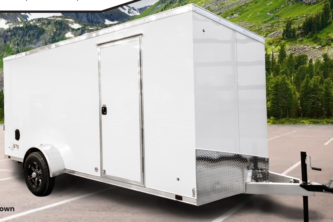
Stō 300 6.7' x 14' Shown

The new Stō 300 & 400 Series cargo trailers are loaded with standard features and options to help you get down the road efficiently and securely.