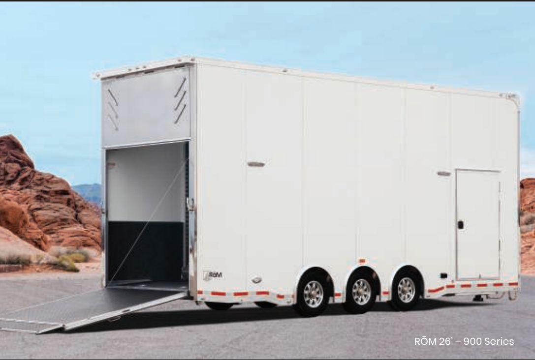
RōM 26' – 900 Series